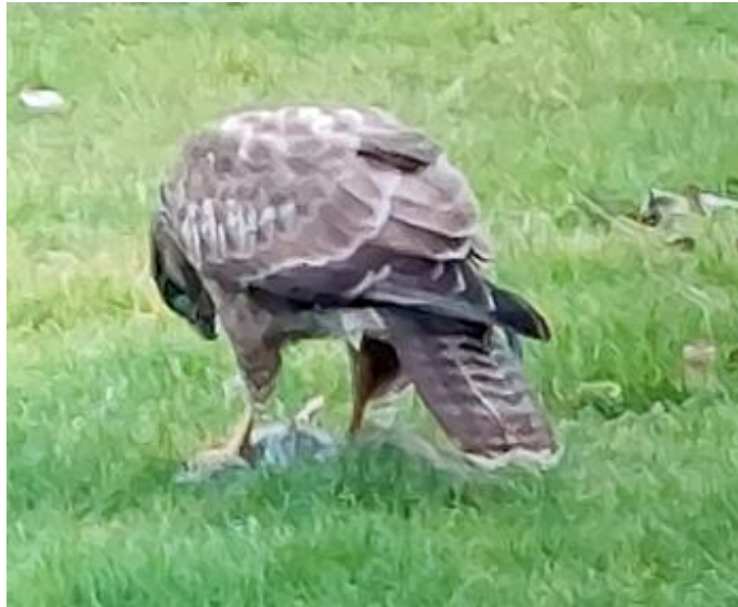
Buzzard with a captured grey squirrel at the side of the Green.