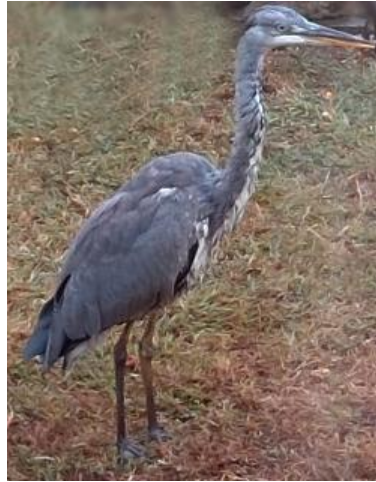
Grey heron wandering around looking for a pond where there might be food.