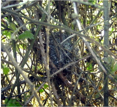
Long-tailed tits' nest in hedge at edge of Green.