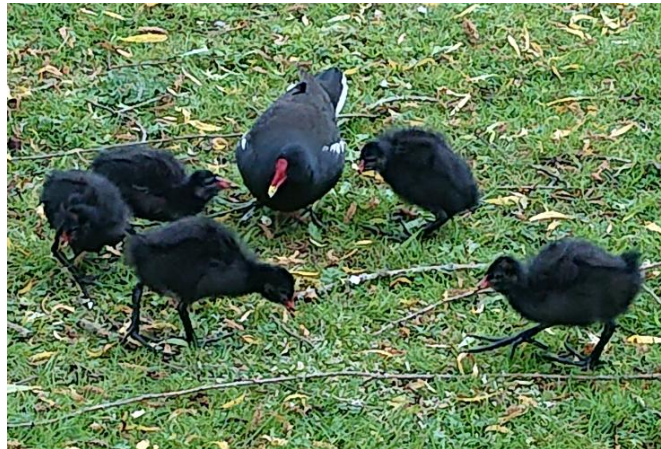
Well-grown moorhen chicks with mum. Note the large lily-trotter feet.