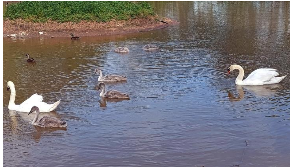
Mute swans with their cygnets on the Green.