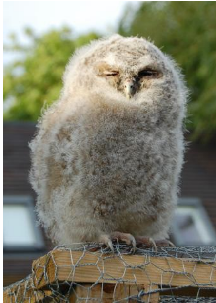
Juvenile tawny owl hatched in an oak tree at the edge of the Green, perched in the author's garden.