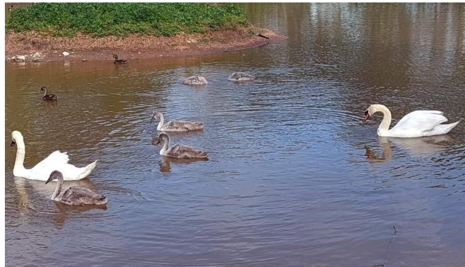
Mute swans with their cygnets on the Green.