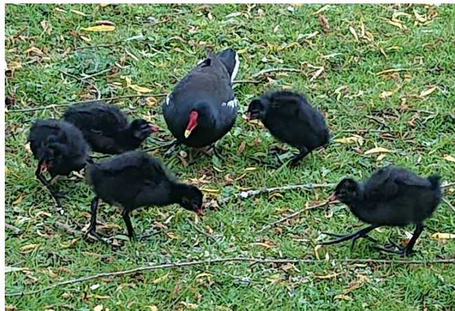
Well-grown moorhen chicks with mum. Note the large lily-trotter feet.