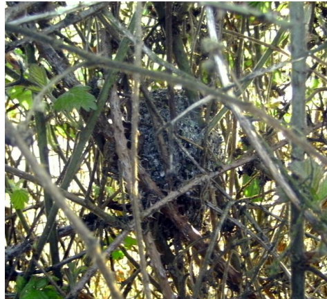
Long-tailed tits' nest in hedge at edge of Green.